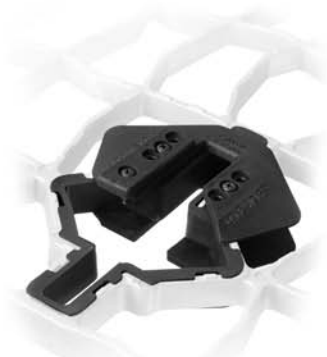
WOLF JAWS™ "COMBO"