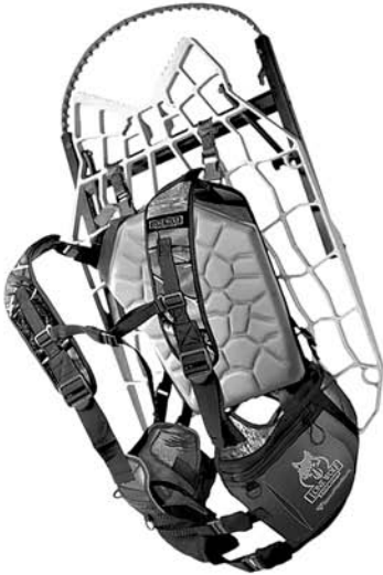
THE WOLF PACK™

SEE THE LATEST FROM LONE WOLF AT WWW.LONEWOLFSTANDS.COM