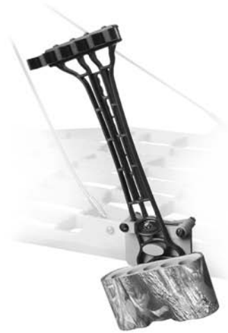
LONE WOLF QUIVER AND QUIVER STAND MOUNT