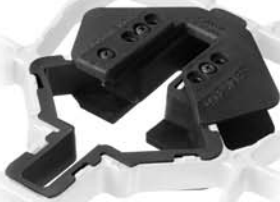
WOLF JAWS™ "COMBO"